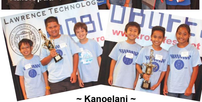
~ Kanoelani ~