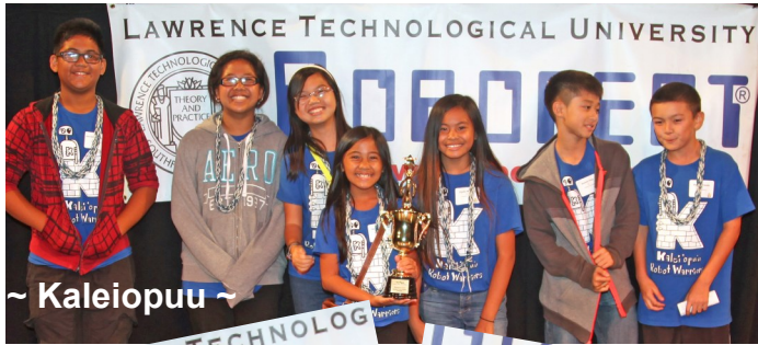
~ Kaleiopuu ~