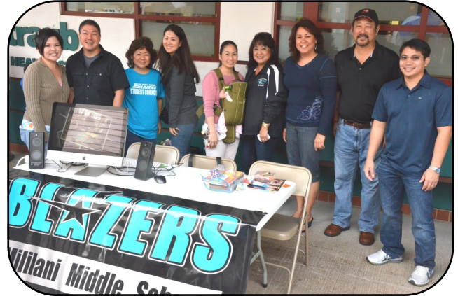
Mililani Middle School staff at February's Fair

The behaviors and values that Character Counts teaches can help to build a solid foundation for our youngsters that they will carry into their lives beyond the classroom.