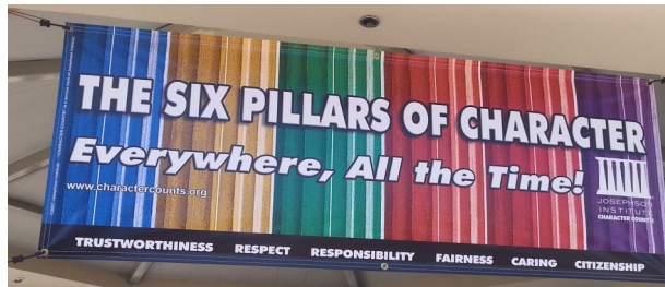
All Mililani schools incorporate the “Six Pillars of Character” into their programs: Trustworthiness, Respect, Responsibility, Fairness, Caring & Citizenship.

Mililani schools took over Mililani Town Center for a day this month to celebrate Character Counts .