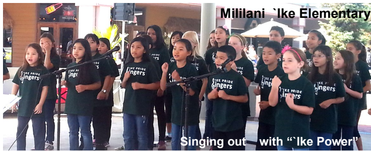
Singing out with “Uka Power”

The Character Counts program involves not only students’ behavior with one another, but also student/teacher interaction and families in the home as well.