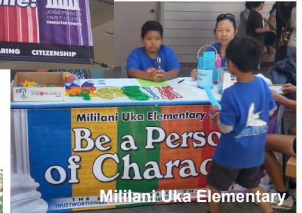
Hundreds of students and their families enjoyed a day of entertainment, games and a variety of informational booths.

Mililani schools took over Mililani Town Center for a day this month to celebrate Character Counts .