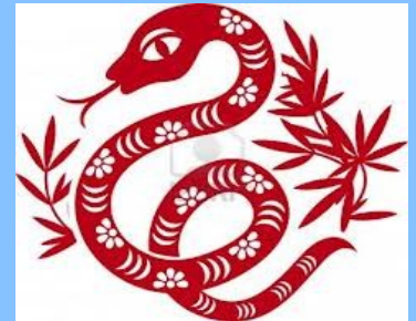
2013—Year of the Snake

Again this year, I will be at our Neighborhood Board and other community meetings and always look forward to joining you in the many special events that celebrate our successes and strengthen our shared traditions. The legislative process can only be meaningful if we lawmakers hear from you about how we can best serve your needs. I welcome your calls and emails with comments and suggestions; my staff and I are ready to help in any way we can.