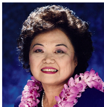
Above, U.S. Rep. Patsy Mink.

Great news! Starting this 2024-2025 school year, girls' flag football is now offered at all 44 public high schools statewide, along with a handful of private schools. This marks the first new sport for high school girls in nearly twenty years and is a significant step in continuing the legacy of U.S. Representative Patsy T. Mink. Her groundbreaking work on Title IX has been instrumental in ensuring gender equality in our schools. This new program reflects Patsy Mink's vision of a world where all students, regardless of gender, have equal opportunities.