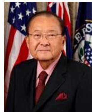
The school’s namesake, the late U.S. Senator from Hawaii, Daniel K. Inouye