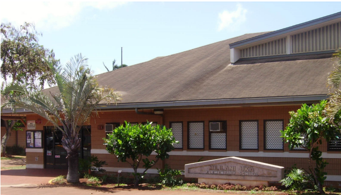
Campus upgrades underway at Mililani Uka Elementary (above)

Funds that the legislature approved will be used for electrical system upgrades at Mililani Uka Elementary during the year. A contract for $582,721 was awarded to Network Power Solutions, Inc., earlier this month to carry out phase 2 of these upgrades; school leaders and the contractor are developing a schedule to work around campus activities.