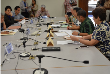
Senator meeting in conference with House members to come to an agreement on certain bills.