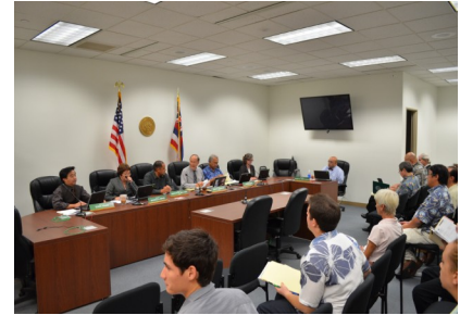
Senator's committee in a joint meeting with the Higher Education Committee discussing University of Hawaii procurement.