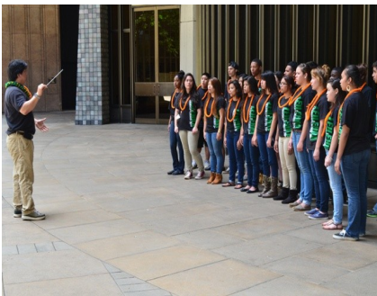
The Leilehua High School Choral Group performing at the State Capitol. Capitol employees and legislators enjoyed their songs, particularly their rendition of Danny Boy in tribute to the late Senator Daniel Inouye. Prior to their coming to the capitol, the group performed at Honolulu Hale.