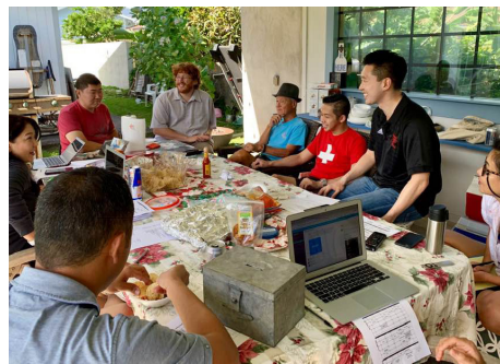
Sharing ideas at our Kailua policy retreat on December 16, 2018

SB 353: Requires DLNR to establish a two-year pilot program to install sunscreen dispensers at Hanauma Bay and Waikiki beaches to provide sunscreens without oxybenzone or octinoxate to visitors and educate visitors on the harmful effects of oxybenzone and octinoxate on the marine environment. Appropriates funds for the pilot program.