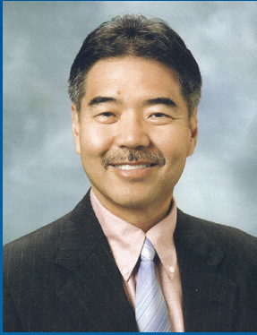
Hau'oli Makahiki Hou!

The 26th Legislature was called to order on January 19 in the spirit of hope and readiness to tackle the many pressing issues facing our State. Senate members were eager to collaborate with the new Governor and the House of Representatives to begin rebuilding our community and charting a new course for a better future.