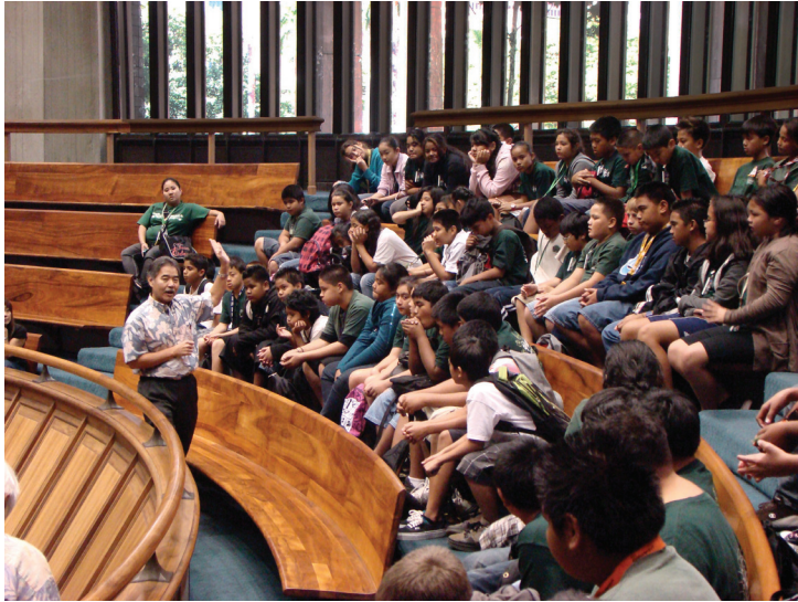
Senator David Ige addresses sixth grade students from Waimalu Elementary School on January 27th.