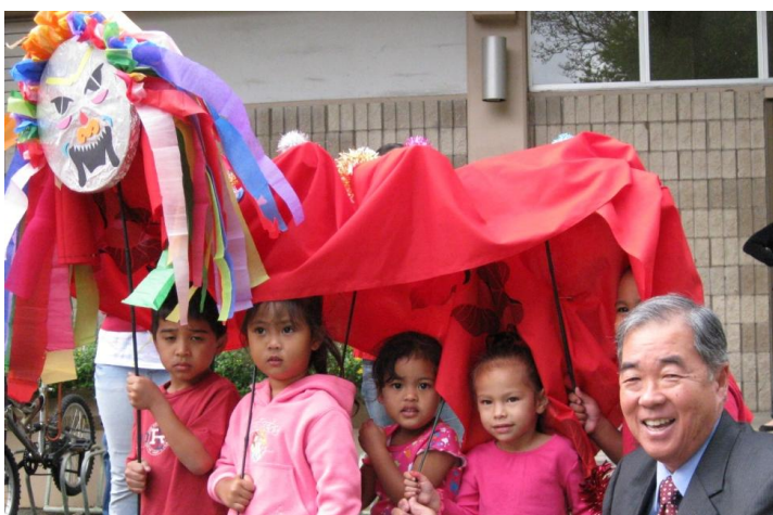
Honolulu Community College celebrated their 90 th Anniversary with festivities, including a Chinese Lion Dance by enthusiastic preschoolers.