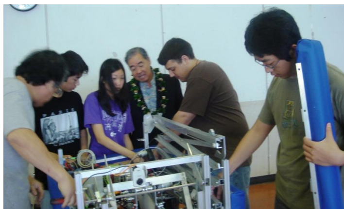
Various school teams took part in the FIRST Robotics Competition Scrimmage at Moanalua High School.