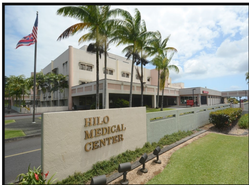
Hilo Medical Center