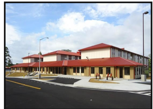
UH-Hilo Hale 'Alahonua Housing