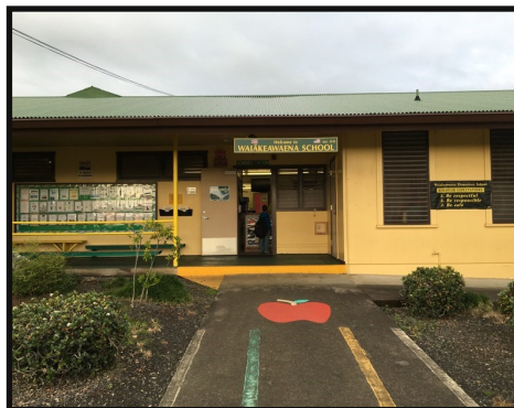
Waiākeawaena Elementary School