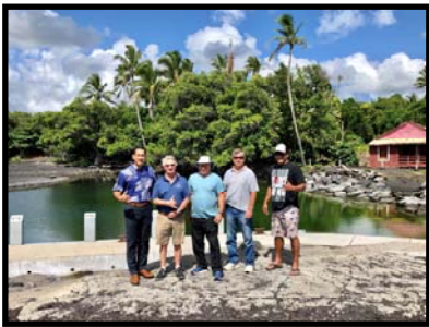
Pohoiki Boat Ramp

I want to thank those who participated in these discussions. Because of these visits, we were able to learn about the challenges as well as opportunities that exist in Hawai'i. We hope to address and work on these issues in the upcoming session and look forward to continuing these conversations in the future. Provided below are some of the highlights from our visits.