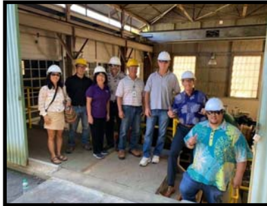
Wailuku River Hydroelectric Plant