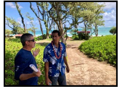
Mālaekahana State Recreation Area