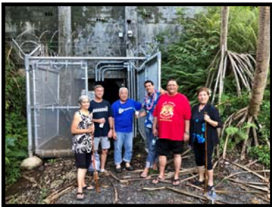
Waihe'e Tunnel & Watershed