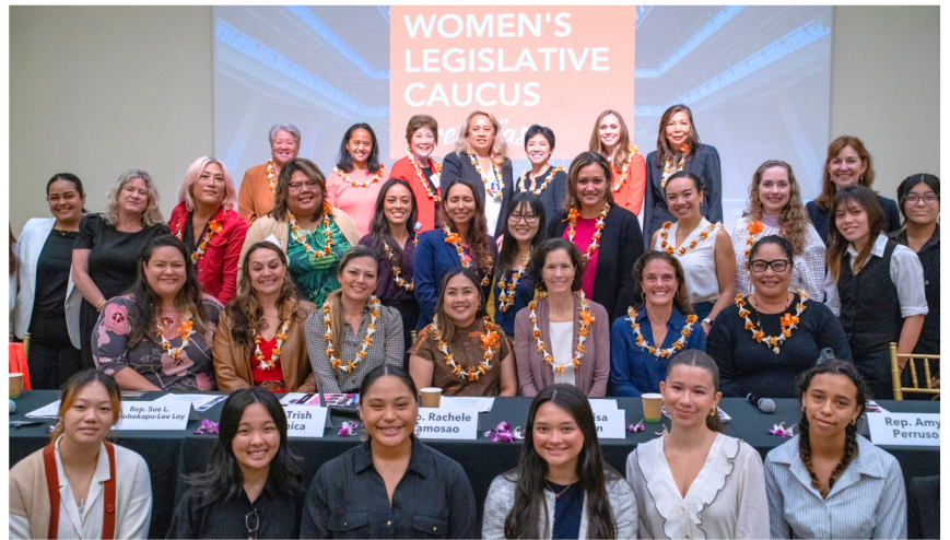
Senate and House members convened at the YWCA of O'ahu to unveil the 2025 legislative package focused on uplifting women in our communities; attendees were given the opportunity to ask the legislators about their plans and goals for the session.

On January 22, members of the bipartisan Hawai'i Women's Legislative Caucus (WLC) hosted a panel discussion at the YWCA of O'ahu to present their 2025 Legislative package, continuing their efforts to improve the lives of Hawai'i's women, children, and families. The WLC is a formal, bipartisan, and bicameral group focused on advancing legislation that supports women, children, and families, with 23 women Representatives out of 51 members and 8 women Senators out of 25 members. You can view the entire 2025 Women's Legislative Caucus package by visiting the Hawai'i State Capitol website at www.capitol.hawaii.gov .