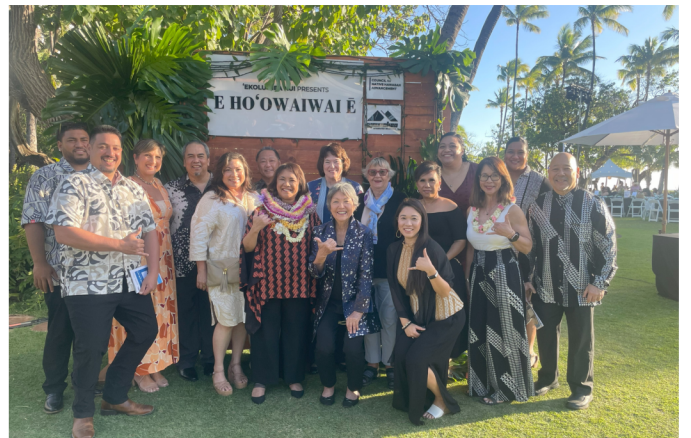
It was a good afternoon at Lanikūhonua Cultural Institute for the for the Women's Prison Project to be recognized at the E Ho'owaiwai Ē Awards!