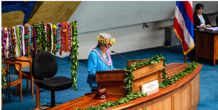
It is always an honor for me to present on the Senate Floor.