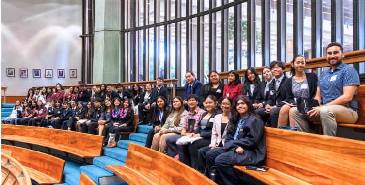
Students from all over the state gathered at the Senate Chambers to be recognized.

The "Elevating Voices From the Classroom" event was held by the Chamber of Commerce Hawai'i at the Capitol on January 17. This event, focused on developing Hawai'i's next generation of leaders, gave high school students the chance to pitch real community issues and solutions to lawmakers. The students also held a workshop to dive deeper into advocacy and civic engagement. This event encouraged students to find ways to make their voices heard and create positive change. I was pleased to spend some time with the visiting students in the Senate Chamber, and look forward to seeing the great things they'll contribute to our community in the future.