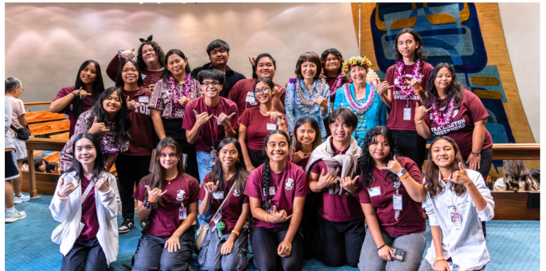
Students from my alma mater, Farrington High School, were part of the program - go Govs!