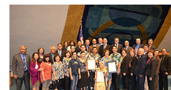
Senator Keith-Agaran spoke to Maui members of the Developmental Disabilities Council on March 14th.