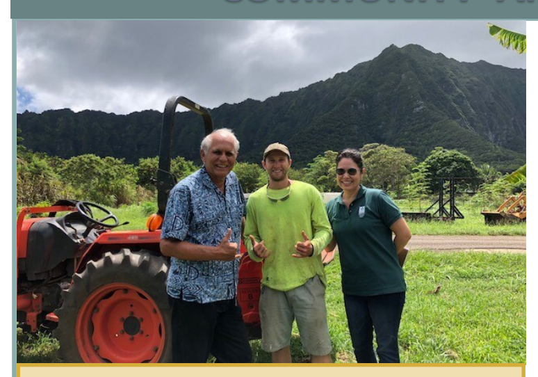
Sen. Gabbard was given a tour of GoFarm at CTAHR Research Station in Waimanalo by Dir. Janel Yamamoto. Go Farm's mission is to help grow Hawai'i's food security and economy by increasing the number of local farmers.