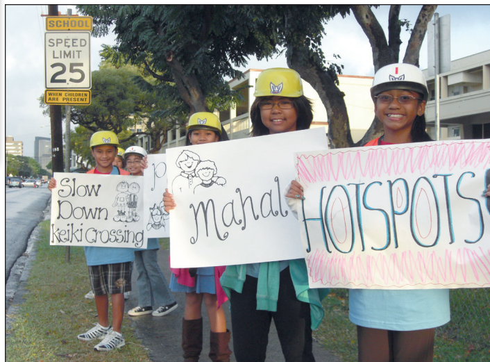
Kaahumanu students signhold to emphasize safety around their school.

develop a 'one-stop' telecom and broadband permitting process. Various state-county coalitions applying for federal broadband grants for health IT, public safety and public tech infrastructure will report back to the legislature before the 2011 session.