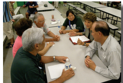
Senators Fukunaga and Taniguchi discuss proposals with residents.

Although no consensus was achieved on the best solutions, area legislators are mobilizing a broader coalition with state/county agencies, care providers, area churches, businesses, large landowners and other stakeholders to develop specific short- and long-term solutions for the region. Among the recommendations: (a) establish 'safe haven' areas in existing parks, (b) identify available apartment units to subsidize as 'Housing First' transitional housing in the area, (c) increase HPD presence in McCully-Moilili neighborhoods, and (d) inventory public facilities available for temporary housing.