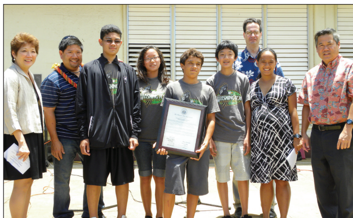
Area legislators congratulate WMS video team for 1st Place award in OLELO student competition.