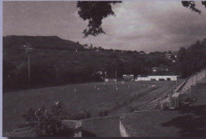
The Roosevelt High School field is being renovated with an artificial turf surface and new all-weather track.

Condo "Court" Clarification – Act 242 (SB 1654) clarifies the requirements for condominium management dispute resolution for