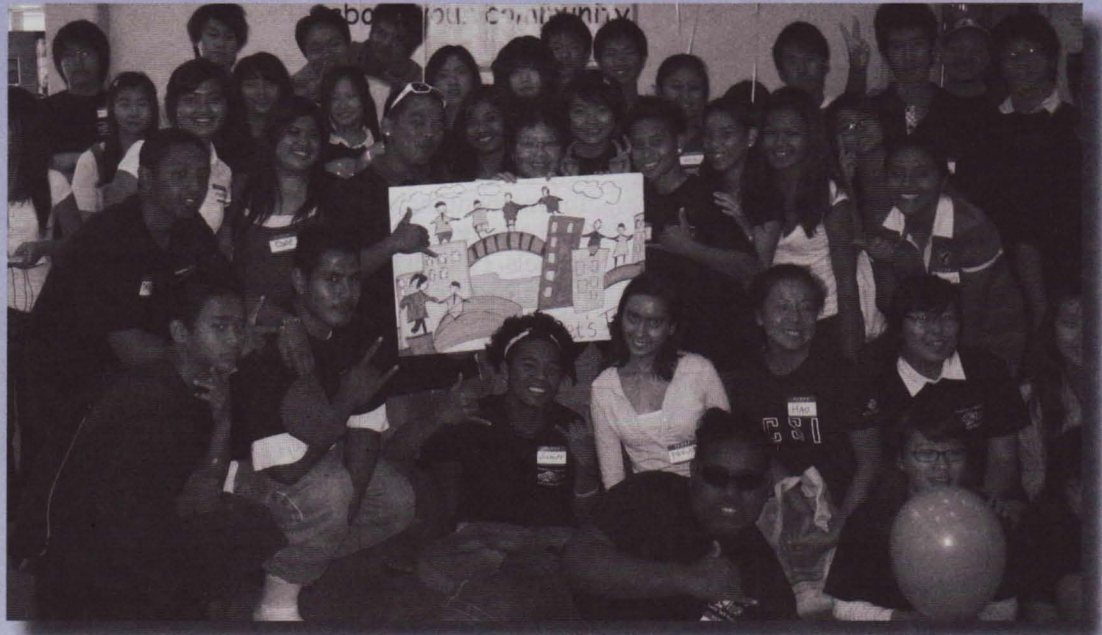
Student participants at recent community briefing on McCully-Moili'ili, Ala Moana/ Sheridan-Kaheka, and Kaka'ako mauka needs assessment results.