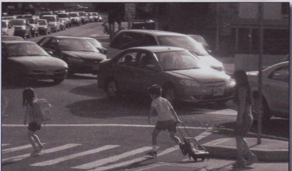
Royal School students face heavy morning traffic at Punchbowl/Vineyard.

Makiki, Ala Moana and McCully mixed-use/residential communities, have lots of cars on the roads. These neighborhoods also have many residents who walk, bike, and run. To make neighborhoods safer for pedestrians and motorists, Act 54 requires Department of Transportation and county transportation departments to adopt a complete streets policy. “Complete streets” means roadways that accommodate all travelers - particularly users of public transit, bicyclists, pedestrians, and motorists - to enable all users to use the roadway safely and efficiently.