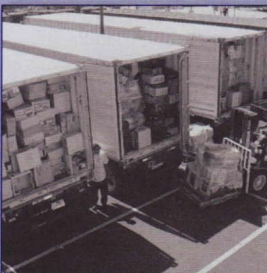
2008: UH and Apple collected millions of pounds of computers during their e-waste recycling drive.

Drop off or schedule a bulky item pick-up with your area legislators for recyclable trash and raise funds for Kaahumanu Elementary School and Washington Middle School. The schools will be paid for scrap metal, newspaper, cardboard, beverage containers, cellular phones, printer cartridges and cooking oil. Call 586-6890 for information.