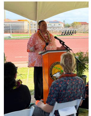
Sen. Fevella giving a speech