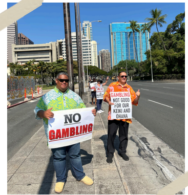
Sen. Fevella sign waving in front of the capitol.

While we are on the topic of harmful substances, we should mention our fight against SB893, which would introduce casinos at the Aloha Stadium district and the Hawaii Convention Center. The message needed to be loud and clear so the tent and the speakers had to come out for this sign waving. A huge mahalo to everyone who showed up to sign wave - the louder the opposition to gambling, the better. Later that afternoon, we were so glad to hear that SB893 was deferred. Gambling is destructive to families, plain and simple. If the new stadium project needs to be funded by the introduction of casinos into our communities, then the project was questionable to begin with. Testifiers made this very clear to our Senators and ultimately, the right decision was made.