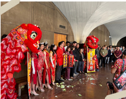
Legislators taking photos with special guests.