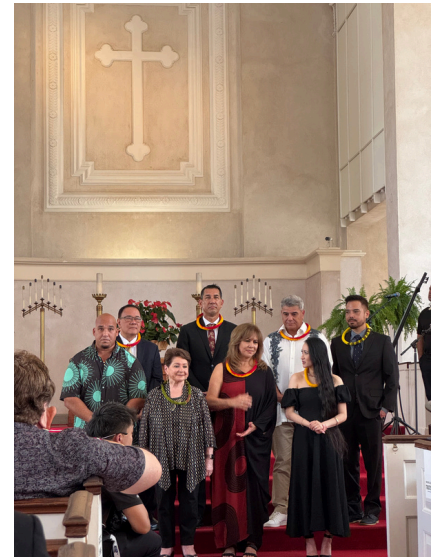
Board members during the investiture ceremony.

The Office of Hawaiian Affairs had their investiture ceremony last month to induct their board of trustees. It was only right for me to stop by to congratulate some friends on their new positions as board members. Native Hawaiian culture often gets sidelined, meaning students are leaving school knowing less and less about the history of our state and Ōlelo Hawai'i is fading away. There is a responsibility shared between OHA and myself to promote the rich culture of our islands. Let's wish our trustees the best for this upcoming year!