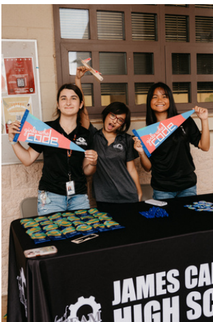
Students showing off a "Girls Who Code" flag

James Campbell High School hosted a one of a kind event earlier this year with their Women in STEAM Day, which I was lucky to be invited for. As an alumni, nothing makes me happier than seeing JCHS providing better and better opportunities for students to get ahead. Professional women from SSFM and STEMworks showed up to offer valuable career resources. Students were platformed to show off their approaches to engineering questions and programming - some of the most sought after fields of work in Hawaii. Inclusivity in STEAM is only going to grow more important, so mahalo to JCHS for recognizing it early.