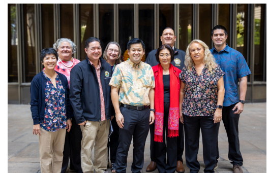
Members of the Kupuna Caucus on press conference day

At the Kūpuna Caucus press conference, food and health security were the highlights of our bill package. A significant number of our Kūpuna rely on low-income welfare programs to support themselves up which is why the bills included in our package aim to restore SNAP benefit levels, fund in-home services, and extend rent supplement programs. You do not have to be a member of the caucus to attend these conferences - many who came out simply wanted to provide their perspective. Our package extends from SB877 to SB881. You are invited to support the bills you believe would improve quality of life for you or your loved ones.