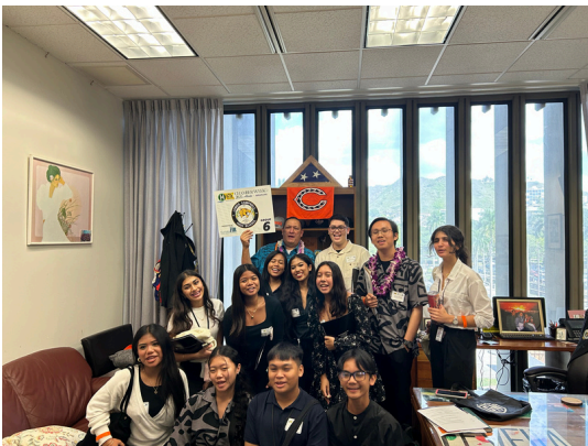
Campbell HS students with Sen. Fevella in his office

It's always a treat when students get to visit our capitol. For Chamber week, high school students including those from JCHS made their way to the square building to present their solutions to problems they face everyday - ranging from education to infrastructure. These young advocates are always encouraged to speak up because they know their issues best and the insight they've gained helps policy makers like myself make more informed decisions. Campbell students later made a visit to our office to discuss the Ewa Beach public and school library's inadequate hours, which we later drafted a bill for.