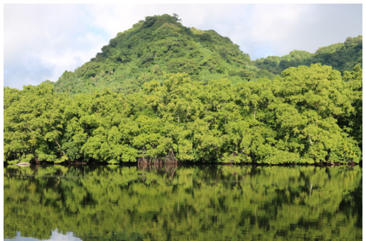
View of Kosrae Island, Federated States of Micronesia. July 1, 2014. (see story on pg 6)