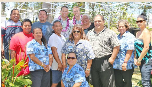
Above - Alamo dedicated staff members gather to celebrate five years of serving Moloka'i visitors.