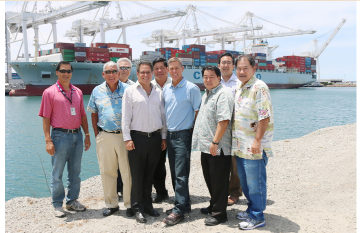
Los Angeles Harbor Facilities tours with Hawai'i Department of Transportation and the Hawai'i Harbor Users Group. July 17, 2014.