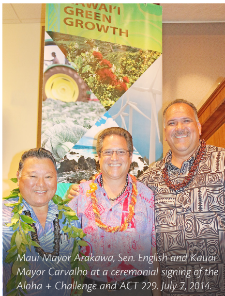
Maui Mayor Arakawa, Sen. English and Kauai Mayor Carvalho at a ceremonial signing of the Aloha + Challenge and ACT 229. July 7, 2014.

For more information on SCR 69, visit: http://www.capitol.hawaii.gov/session2014/bills/