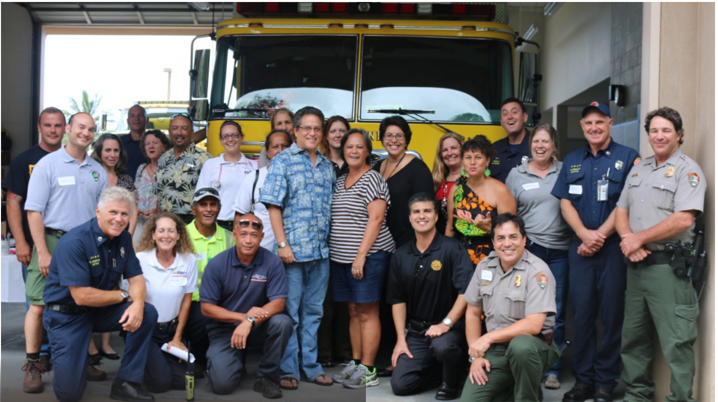
Meeting of Emergency Personnel for East Maui, Hāna Fire Station. July 9, 2014.