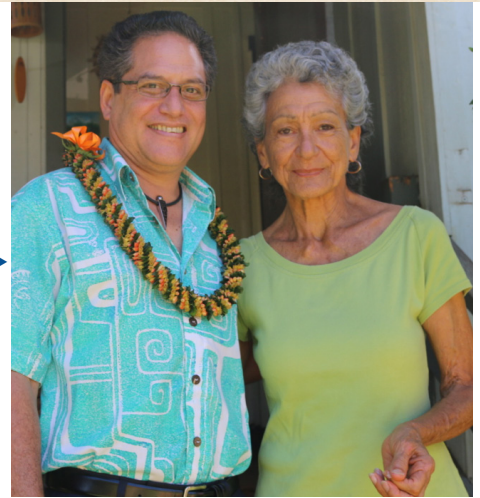
Sen. English visits Auntie Elaine Cockett. Lānaʻi City. July 23, 2014.