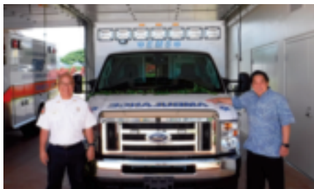
Supporting our first responders in our community by visiting our new Waipio Emergency Medical Services Station and ambulance blessing.