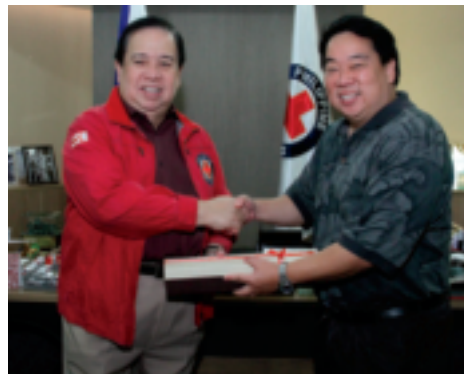
Supporting International Humanitarian efforts by meeting with Philippine Red Cross Chairman and CEO Senator Richard J. Gordon.

Appropriates $1,000,000 to the Department of Business, Economic Development and Tourism to continue bringing together a delegation of at least 2,500 artists, performers, and cultural practitioners from different nations in Oceania to preserve and perpetuate the arts and cultures of their indigenous peoples.