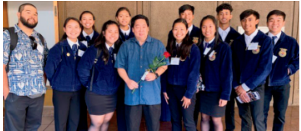
Met with Mililani High School Future Farmers of America students who participated in the 2019 Hawaii State Future Farmers of America Convention.

Appropriates $1,443,000 for services for kupuna and individuals with disabilities who need long-term services and support.