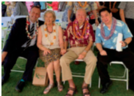
Honored to speak at the celebration of 50 years of life-saving transplant surgeries in Hawaii and National Donate Life Month. Act 001 of 2012, a bill I championed, appropriated funds for The Queen's Medical Center to perform over 2,300 kidney and liver transplants.

Clarifies that a driver of a motor vehicle yield or stop for a pedestrian in a crosswalk.