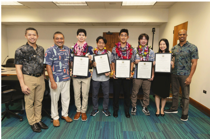
The 'Iolani Raiders were recognized by the House of Representatives for achieving first place at the 2025 Hawaii LifeSmarts State Competition.