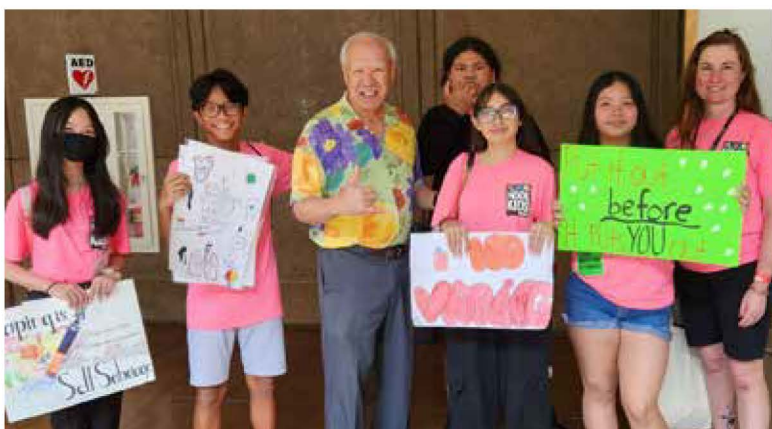
Students from Highlands Intermediate School visited the Capitol on March 20 to inform lawmakers about the youth vaping epidemic, resulting in passage of a measure to raise taxes on all vaping devices.