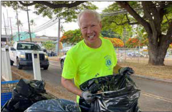
Gregg and other community volunteers cleaned up trash and weeds along the sidewalks fronting Lehua Elementary School on July 29.