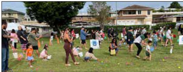
More than 300 youngsters participated April 1st in the annual Easter egg hunt at Momilani Community Center .

The 2023 Legislature approved nearly $10 million for improvements to Pearl City schools.