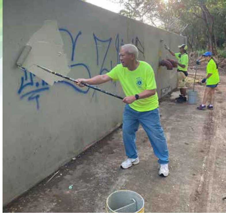
Volunteers with Lions Clubs and other groups celebrated Earth Day on April 22nd by painting out graffiti along the Pearl Harbor bike path.