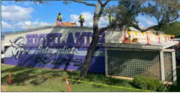
Over the past summer, workers installed new rooftop ventilation fans at Highlands Intermediate School cafeteria .