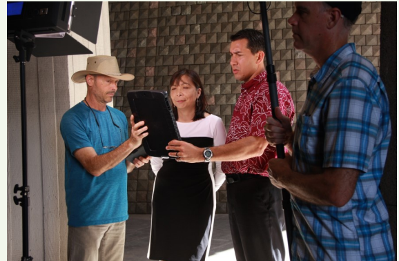
Filming a Rat Lungworm public service announcement with Senator Kai Kahele.