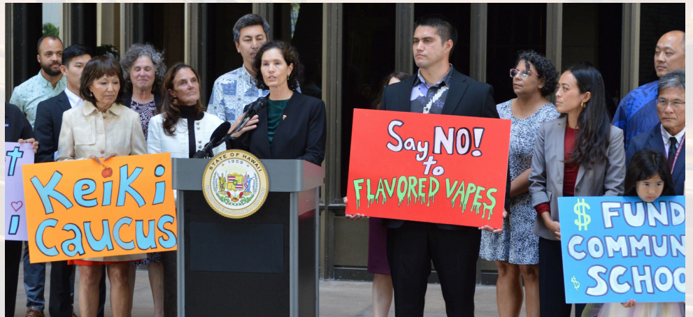
Top left: Education Committee at UH Mānoa, Top right: Kūpuna Caucus press conference, Bottom left: Hawaii State Hospital site visit, Bottom right: Keiki Caucus press conference