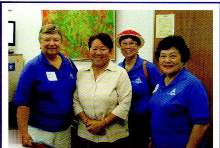
Kaua'i HSTA Retirees stops by and pays a visit with Rep. Morikawa during the legislative session.