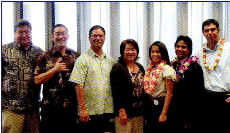
Above: Kaua'i Legislators with honorees of Kaua'i's Boys and Girls club being recognized at an event on O'ahu.