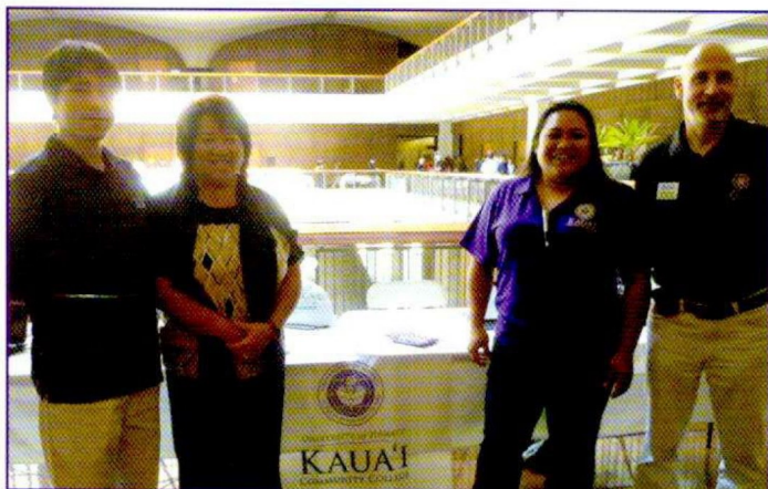
Kaua'i Community College proudly displays their satellite tracking project during Education Week at the State Capitol.