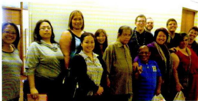
It's always an honor to have the Department of Health's Kaua'i Developmental Disabilities Office come by for their annual visit to the Capitol.

obtained by mail order at any pharmacy of the beneficiary's choice within the pharmacy benefit manager's retail pharmacy network. Requires specified entities to file an annual report with the insurance commissioner disclosing certain amounts, terms, and conditions associated with a prescription drug benefit plan. Requires affected entities to report to the legislature prior to the regular sessions of 2014 and 2015. Prohibits application to community retail pharmacies with a rural pharmacy designation.