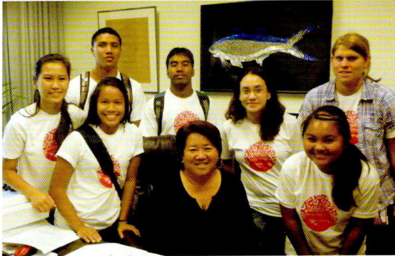
Rep. Morikawa hosts young advocates from Tobacco Free Kaua'i.

HB 672, HD2, SD2, CD1 — Tobacco; Electronic Smoking Device; Minors; Sale or Purchase Prohibited; Tobacco Sales. Prohibits the sale and purchase of electronic smoking devices to minors under eighteen years of age. Requires retailers to sell tobacco only in a direct face-to-face exchange between the retailer and consumer, except for in-bond concessions (duty-free retail), retail tobacco stores, bars, or establishments where the minimum age for admission is