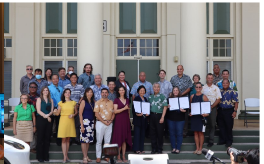
Bill signing ceremony for clean transportation bills, 2021