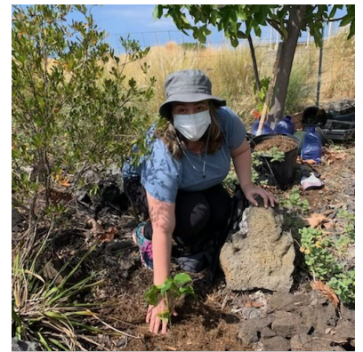
Rep. Lowen planting an 'ohe mauka sapling at Palamanui

At first glance, the land adjacent to the Palamanui Campus looks like it has been completely overtaken by non-native shrubs and grasses. However, amid the fountain grass and haole koa, a wealth of native plants are surviving there — wiliwili, lama, alahe'e trees, and other remnants of native lowland dry forest, a critically endangered ecosystem in Hawaii. Following the discovery of these native resources, The Department of Land and Natural Resources and the University of Hawaii have been working together over the past several years to develop a plan to protect and restore this unique area, and to integrate these efforts into curriculum about natural resource management, conservation, natural history, biology, and threats to Hawaii's ecosystems. In the 2021 session, Rep. Lowen was able to secure $60,000 in the State Budget as a starting point to support these efforts. In July, an agreement was signed for 706 acres of state land adjacent to the Palamanui campus, where the DLNR and UH will partner in managing the new forest reserve area. Rep. Lowen participated in a site visit of the forest reserve in October to learn more about the conservation work that is now underway.