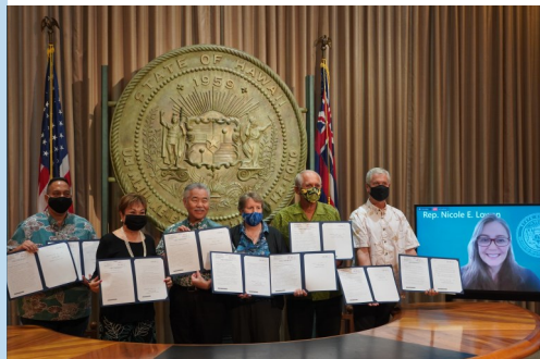
Bill Signing ceremony on World Oceans Day, 2021

If you experience any difficulty using this form, you can also email your responses to replowen@capitol.hawaii.gov . Mahalo for participating!