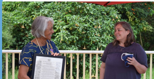
Presenting a certificate for the Kona Coffee Festival's 50th Anniversary

In October, a group of Hawaii Island legislators and the Chair and Vice Chair of the House Committee on Agriculture toured Kona farms to learn more about issues facing farmers. For coffee farmers, the coffee berry borer continues to be an issue, and now coffee leaf rust is also threatening Kona's coffee industry. To support farmers in combatting these pests, the 2021 legislature passed Act 138 to continue the coffee berry