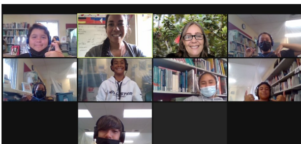
Speaking about civics with 8th graders from Ke Kula O Ehunuikaimalino

Over $11 million in funding was released in October for infrastructure and development of affordable residential lots on DHHL land. This will help to address the need for affordable housing in Kona starting with DHHL beneficiaries.