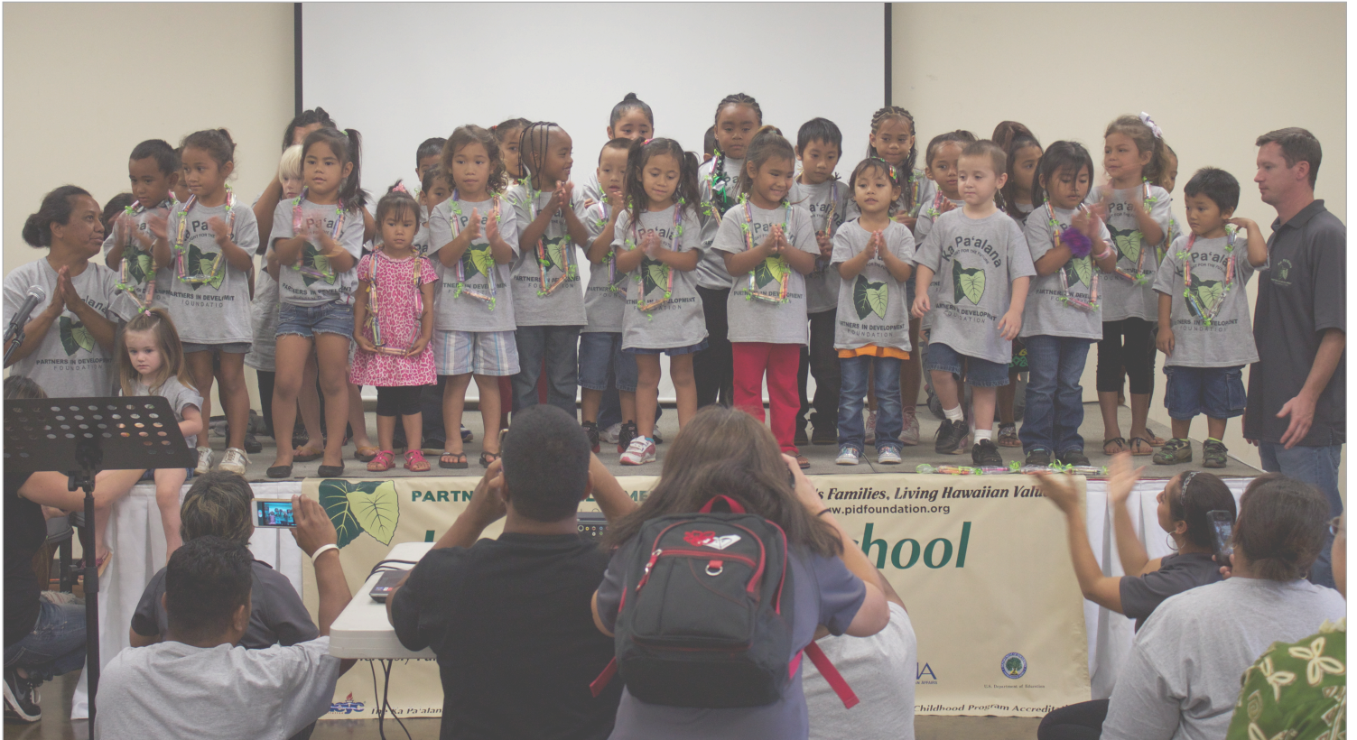
Proud parents took photos of their children on the stage at the Oahu Veterans Center as they performed "What a Miracle".