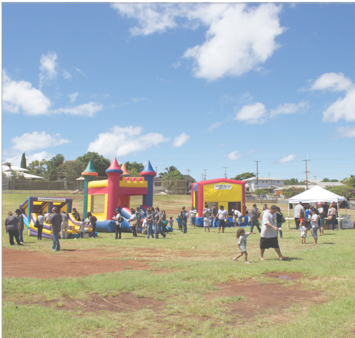
Ka Pa'alana and Partners in Development set up inflatable bouncers and a shave ice booth for the families and their children.