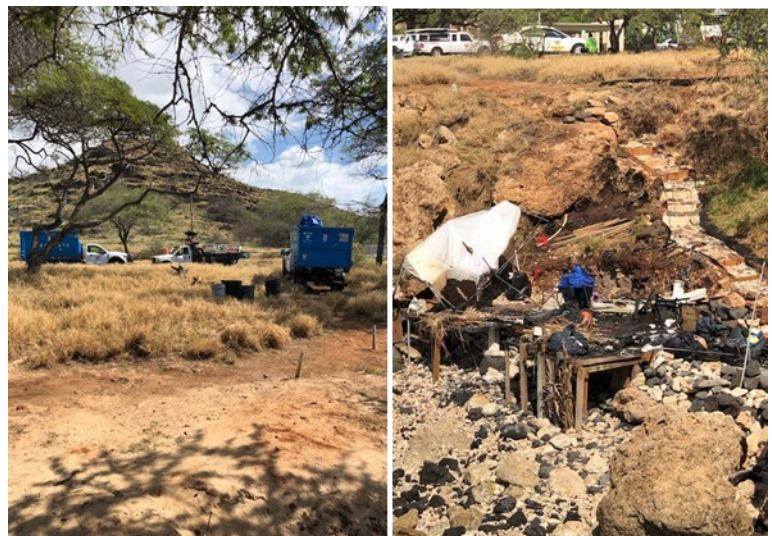
The Department of Land and Natural Resources and the Department of Transportation conducted a clean-up of Kahe Point.