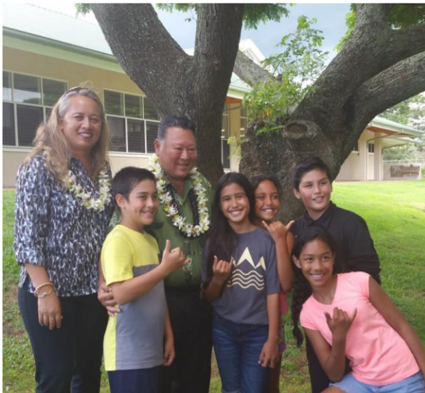
Rep. DeCoite and Mayor Arakawa at Paia Elementary School for the dedication of their photovoltaic panels (August 2015)