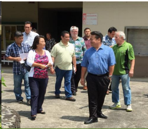
FIN Committee touring Hana High School (Sept 2015)