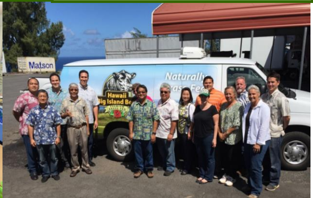
Touring the Big Island Beef Facility on Hawaii Island. (Oct 2015)

**Lana'i Site visits happening in Dec 2015.**