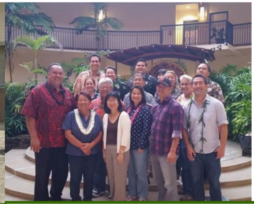
FIN toured the island of Kauai. Learned a lot especially about invasive species, and ended our day with Kauai Mayor Carvalho. (Oct 2015)