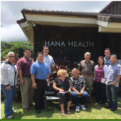
FIN Committee members at the Hana Health Center (Sept. 2015)

insight into the status of ongoing projects and on other specific needs of districts that they visit.