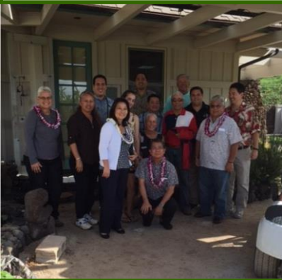
On Molokai the FIN committee visiting the Kawela Mangrove. (Oct 2015)