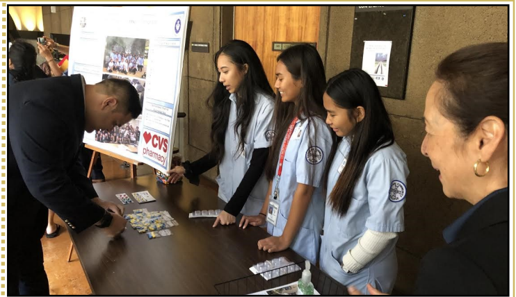
Waipahu High School Pharmacy Technician students showcasing a demo at the Capitol.