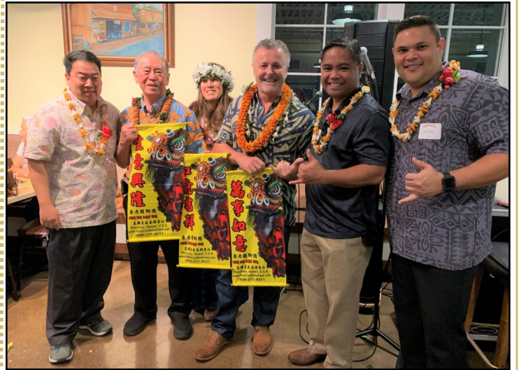
Grand re-opening for Highway Inn's new location.