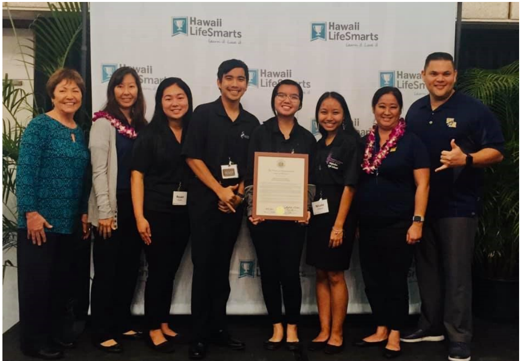
Waipahu High school competing at the LifeSmarts competition.