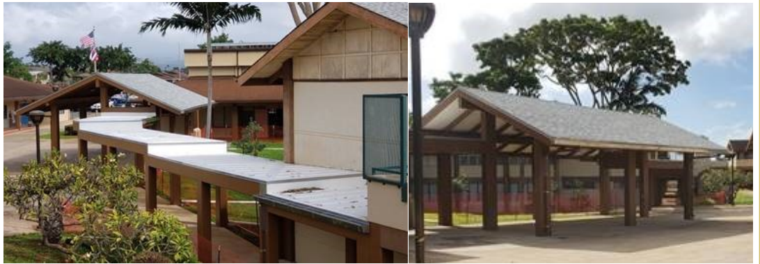
Kalei'opu'u Elementary School's completed covered walkway.

I would like to thank everyone for giving me the opportunity to represent District 39 in the Hawaii State House of Representatives. It has been such a privilege to serve our community. I am honored and greatly humbled by your continued support. I would like to offer you these highlights about the events this office has been participating within the community.