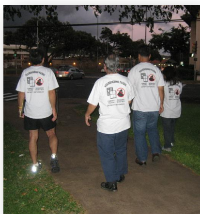
Citizen Patrol Walks