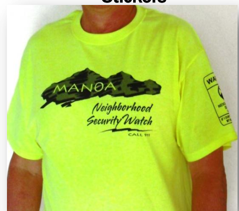
Manoa NSW Tee Shirt