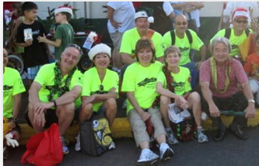
Manoa Christmas Parade