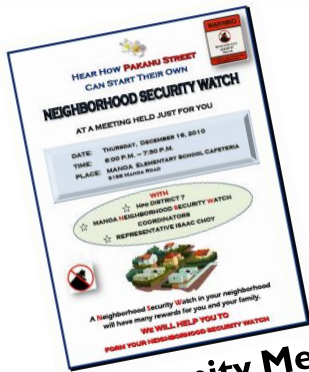
NSW Community Meetings