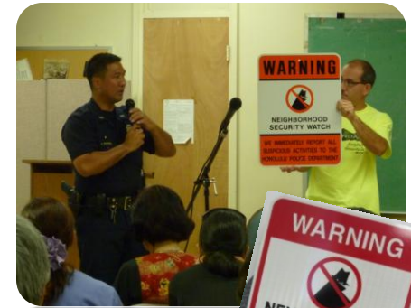
NSW Street Signs