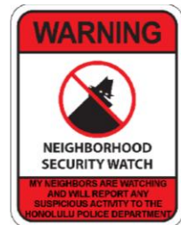
NSW Window Stickers