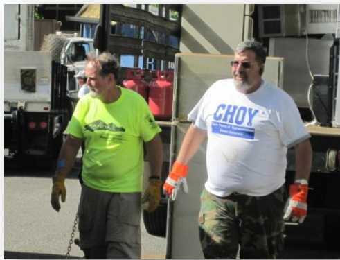
Community Service Projects