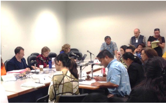
Rep. Aquino alongside other Conference Committee members

The 27 th Hawaii State Legislature ended on May 1. Legislators concluded almost three months of conducting hearings and debating various legislative issues. At the end of this legislative session, legislators were able to approve bills that address a wide range of issues, including raising the minimum wage, requiring mandatory kindergarten, and helping our seniors to name a few.