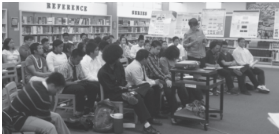
Observing Waipahu High School's legislative mock sessions in the WHS library.

SB2740 Hula Mae. SB2740 authorizes the issuance of $250 million more in revenue bonds for the Hula Mae multi-family housing program. The program is intended to provide affordable rental housing for low-income families.