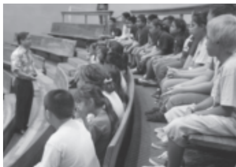
Sharing about my legislative duties with students of Waipahu Elementary in the State House chambers.