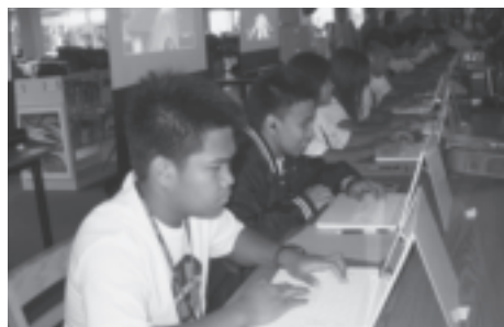
Students competing at the Waipahu High School Dimension U tournament. This was a mathematics competition between various classes and students.

SB2115 Charter School Reform. SB2115 establishes a new chapter