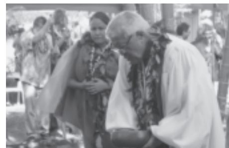
Groundbreaking photo: Leeward Community College recently had a groundbreaking ceremony for an upcoming educational facility on campus.

HB2030 Highway Safety. HB2030 requires motorists to "move over" when passing a stationary emergency vehicle on a highway, and requires drivers to slow down to a reasonable and prudent speed