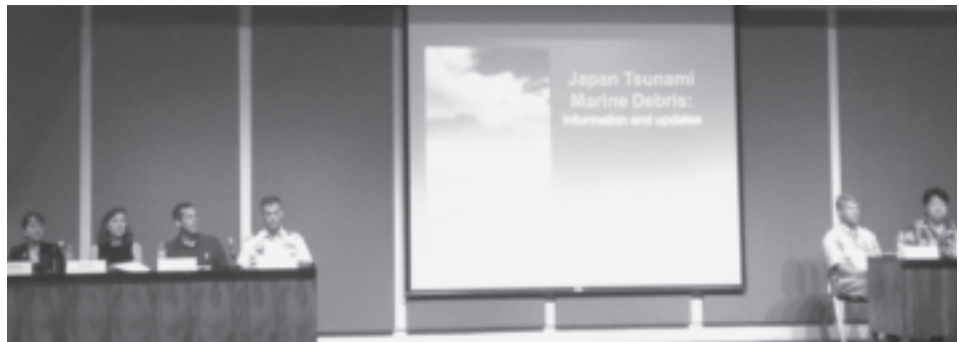
Being briefed on the March 2011 Japan earthquake marine debris issue

SB2220 establishes the boiler and elevator special fund as the depository for fees from inspections, permits, and examinations of boilers, pressure systems, elevators, kindred equipment, and amusement rides. The purpose of the bill is to address the backlog of safety inspections.