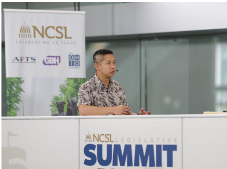
Rep Tam being interviewed at the National Conferences of States Annual Summit in Boston.