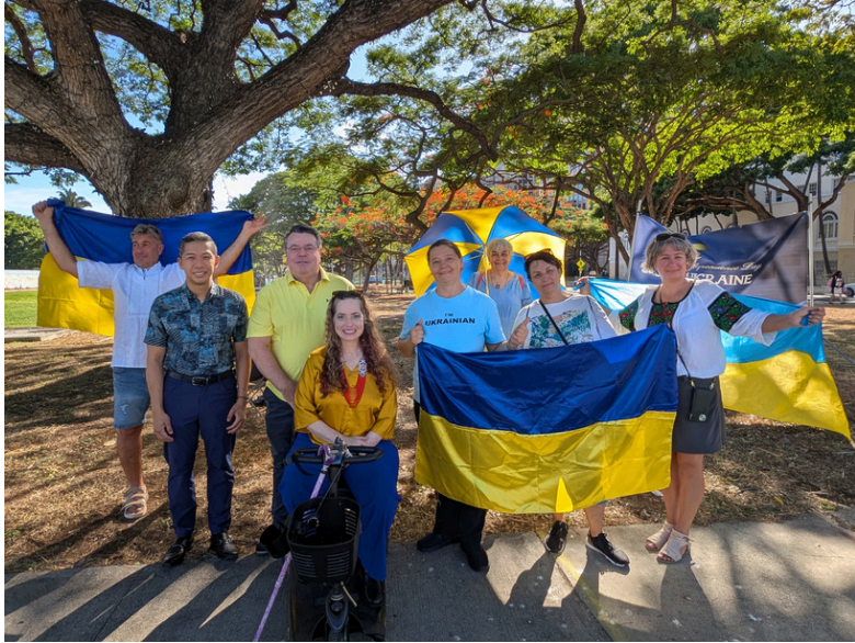
Rep Tam and Rep Amato with community members rallying in support of Ukraine.