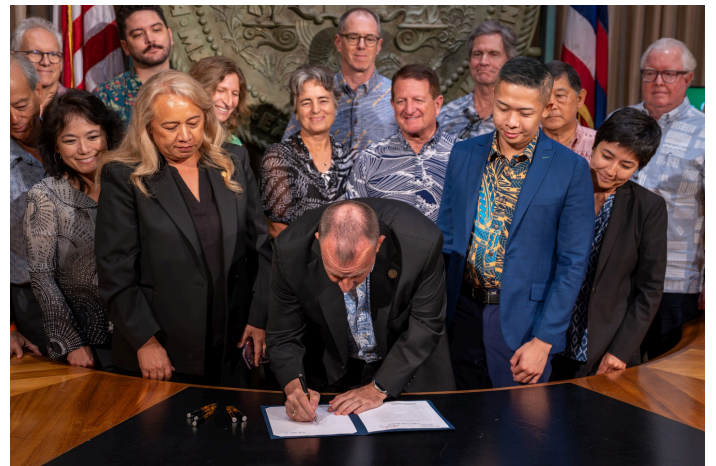
Sen DeCoite, Gov Green, Rep Tam and other officials signing SB1396 a historic win for Hawaii's environmental protections.