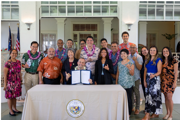
Rep Tam and members of the House and Senate witnessing Gov Green sign a bill into law.