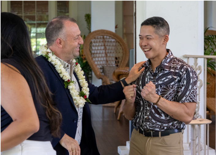
Gov Green and Rep Tam celebrating the passage and signature of key education bills at Washington Place.