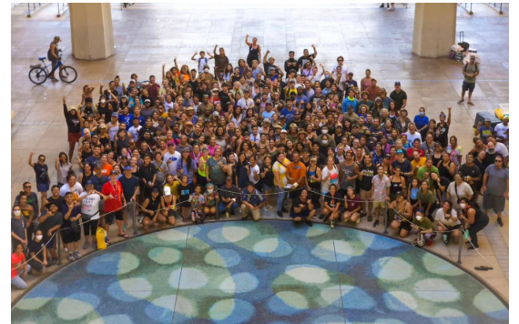
Volunteers, legislators and staff at the State Capitol sorted and packaged donations for Maui. Mahalo!!