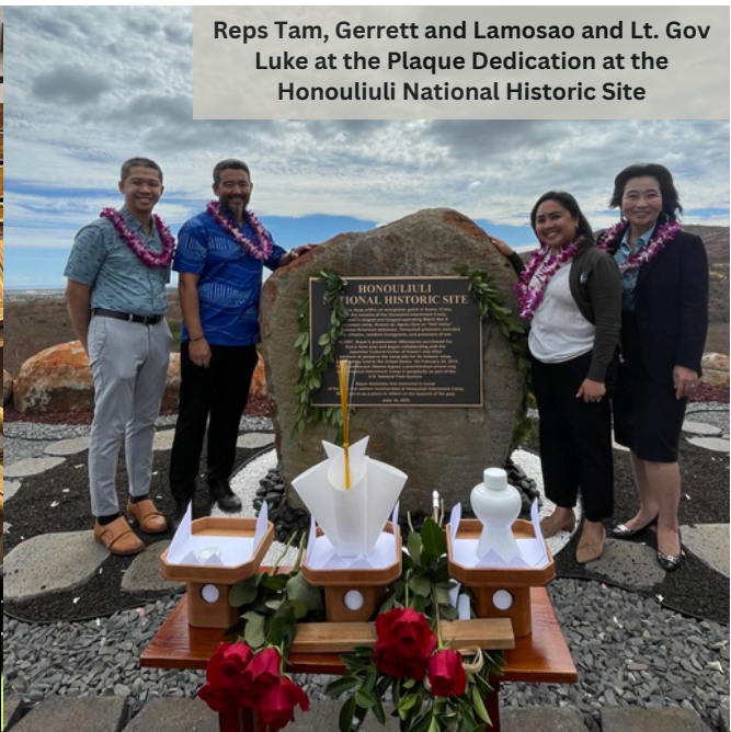
Reps Tam, Gerrett and Lamosa and Lt. Gov Luke at the Plaque Dedication at the Honolulu National Historic Site