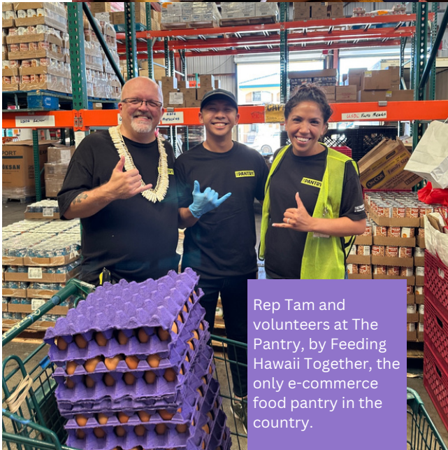
Rep Tam and volunteers at The Pantry, by Feeding Hawaii Together, the only e-commerce food pantry in the country.