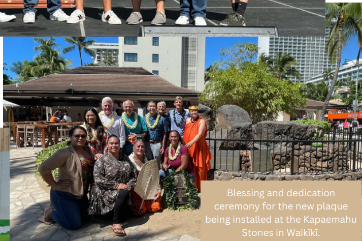
Blessing and dedication ceremony for the new plaque being installed at the Kapaemahu Stones in Waikiki.