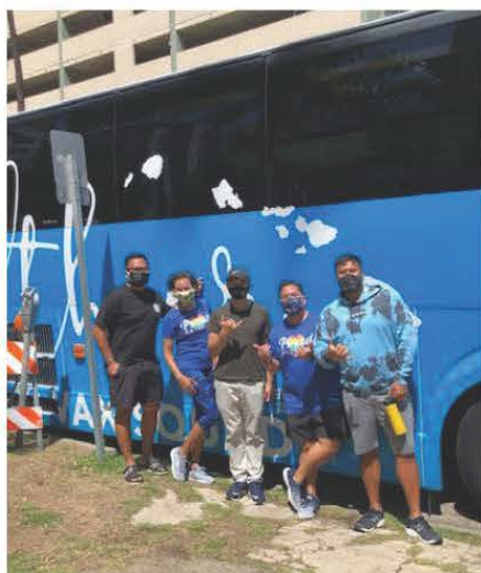
Volunteers from the Rotary Club were on hand to help and support the clinic. Mahalo!