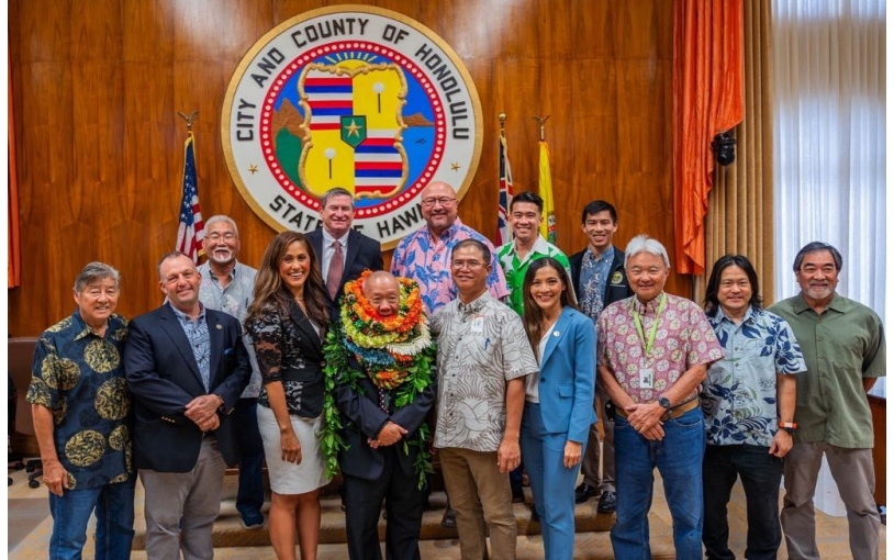
Celebrating Councilmember Calvin Say's retirement with an Honorary Certificate ceremony on Dec. 11, 2024.

The legislation to mandate moped insurance and helmet use aims to protect riders and reduce the risk of severe injuries. By requiring insurance, we can provide financial protection for all parties involved in accidents. Enforcing helmet safety will significantly decrease the likelihood of life-threatening head injuries.