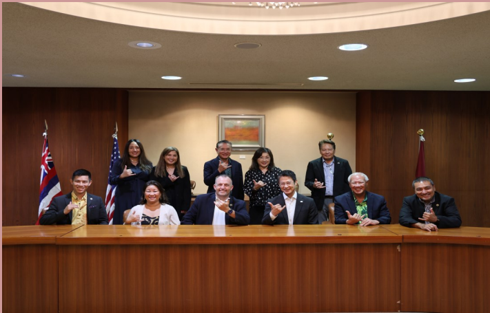
Rep. Sayama with Governor Green, Hiroshima's Governor Yuzaki, and the Delegation of Hawai'i.