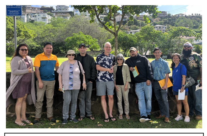
Rep. Sayama meeting with Kaimukī residents to discuss firebreaks and future projects at Mau'umae Community Park.

Despite efforts from the Legislature to eliminate drunk driving, Hawai'i continues to see high traffic fatalities involving DUIs. As a safety measure, drivers can install an ignition interlock device that prevents inebriated drivers from getting on the road. Current state law limits ignition interlock devices to a single product approved by the Department of Transportation. This bill will remove that limitation and allow consumers to select from multiple products, which increases accessibility to ignition interlock devices and improves safety in our communities.