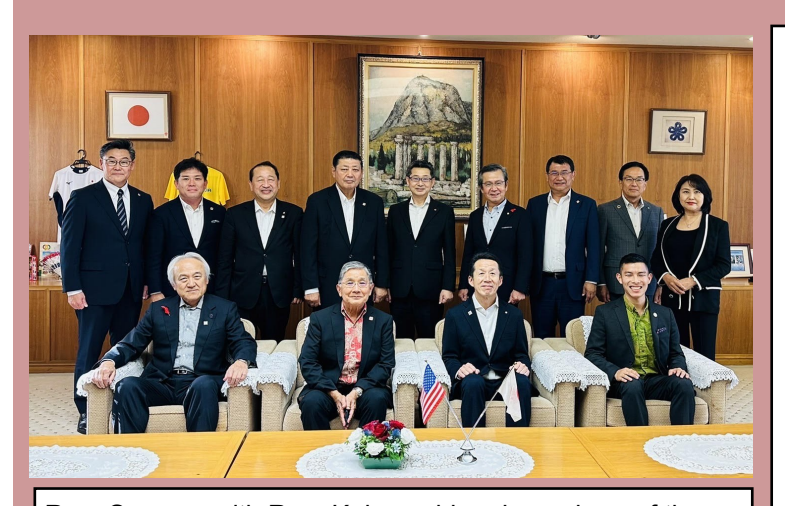
Rep. Sayama with Rep. Kobayashi and members of the Fukuoka Prefectural Assembly.