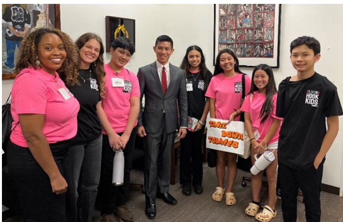
Rep. Sayama rallying with keiki advocates against vaping products.

The bill establishes a Harm to Students Registry for all early learning programs, schools, and K-12 educational institutions within the State. The registry will contain information on school employees, contractors, or volunteers for whom a final finding has been issued as a result of an investigation, indicating that the individual has inflicted harm on a student. The Department of Education, charter schools, private schools, and early learning entities are prohibited from considering for employment any person listed on the Harm to Students Registry.