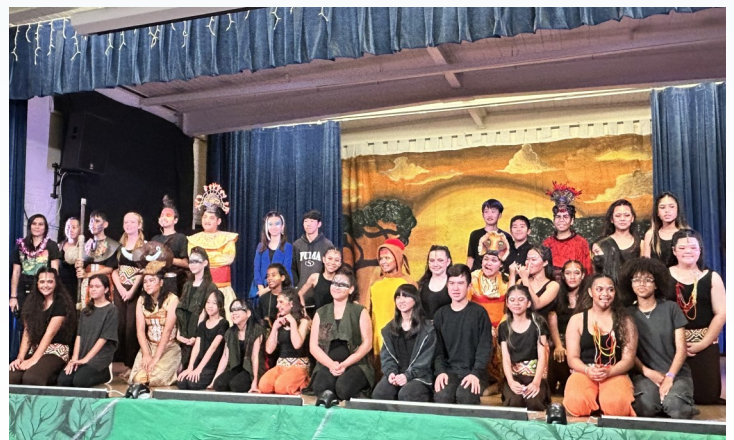
Rep. Sayama at Jarrett Middle School for the Lion King performance by the Afterschool All-Stars Program.