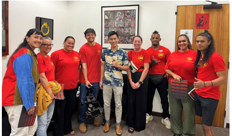
Rep. Sayama with members of Maui advocacy group Lahaina Strong.

Hawai'i is the only state without a fire marshal's office. A fire marshal will provide an integral role in coordinating fire prevention between local agencies. By creating a permanent division of the state fire marshal within the Department of Labor and Industrial Relations, we hope to ensure public safety from catastrophic events.