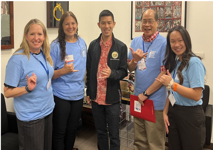
Rep. Sayama with representatives from American Cancer Society on Cancer Action Day.

The objective of this bill is to protect consumers by verifying that coffee labeled with specific geographic origins such as "Kona" or "Kaua'i" actually contains a substantial proportion of coffee sourced from those regions. It establishes incremental criteria for the minimum percentage of coffee from the declared origin and includes exemptions for retailers who do not package coffee, shielding them from liability if the labeling fails to meet these standards.