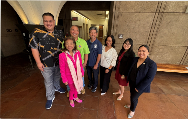
ILWU LOCAL 1000

$15.5 Million awarded for community based services!