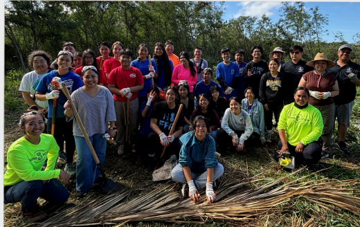
PARK CLEAN UP ON EARTH DAY