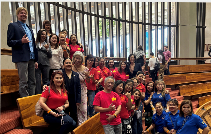
CAREGIVERS FROM VARIOUS ORGANIZATIONS IN SUPPORT PASSAGE OF HB 2216 (AFHA, YCHH, CHAH, APPCA)

Reducing the minimum number of years of credited service from 10 to 5 years without any fiscal impact would deeply help employees with recruitment and retain their employees.