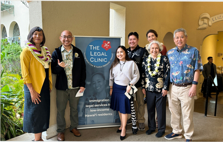
FILIPINO CAUCUS WITH THE LEGAL CLINIC