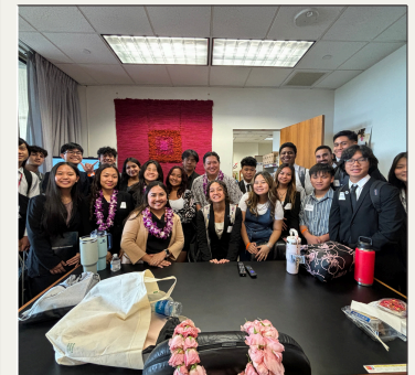
TBT WAIPAHU HIGH SCHOOL MODEL UN

With the help of students from Waipahu High School Model UN, who shared their research on illegal dumping during a visit to the Capitol. Representative Chun and I proposed House Resolution (HR) 76 and House Concurrent Resolution (HCR) 92 to urge the State, City and County, and Military about the concerning problem of illegal dumping surrounding Waipahu.