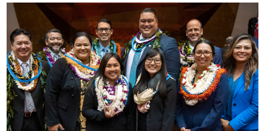
Freshmen class on sine die, May 4, 2023, celebrating the completion of their first Legislative Session.