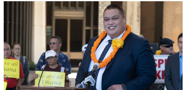
Rep. Kila participated in a rally at the Hawaii State Capitol calling for safer streets.